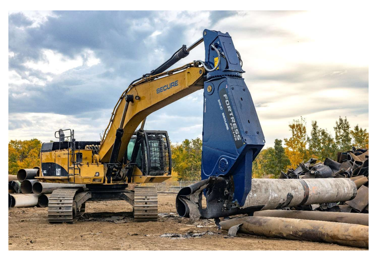
Waste Services (hazardous and non-hazardous materials that are recycled and/or safely disposed)

Below is a photograph of SECURE's Red Deer Metals Recycling Facility.